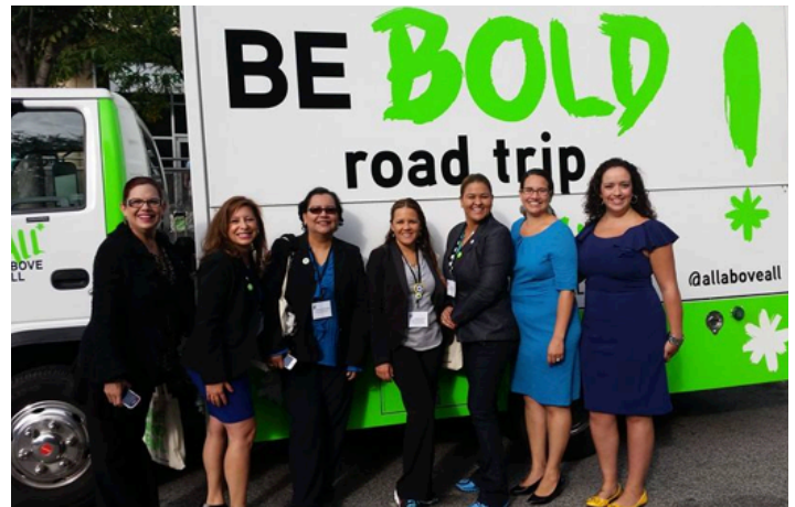
NLIRH staff and activists at All* Above All Hill Education Day on September 17, 2014.

Latinas across the country who see the impact of the Hyde Amendment in our communities and who are working every day for the human right to healthcare and reproductive self-determination.